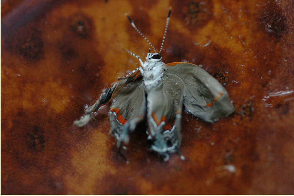
Richard Day - BGS Spring 2009