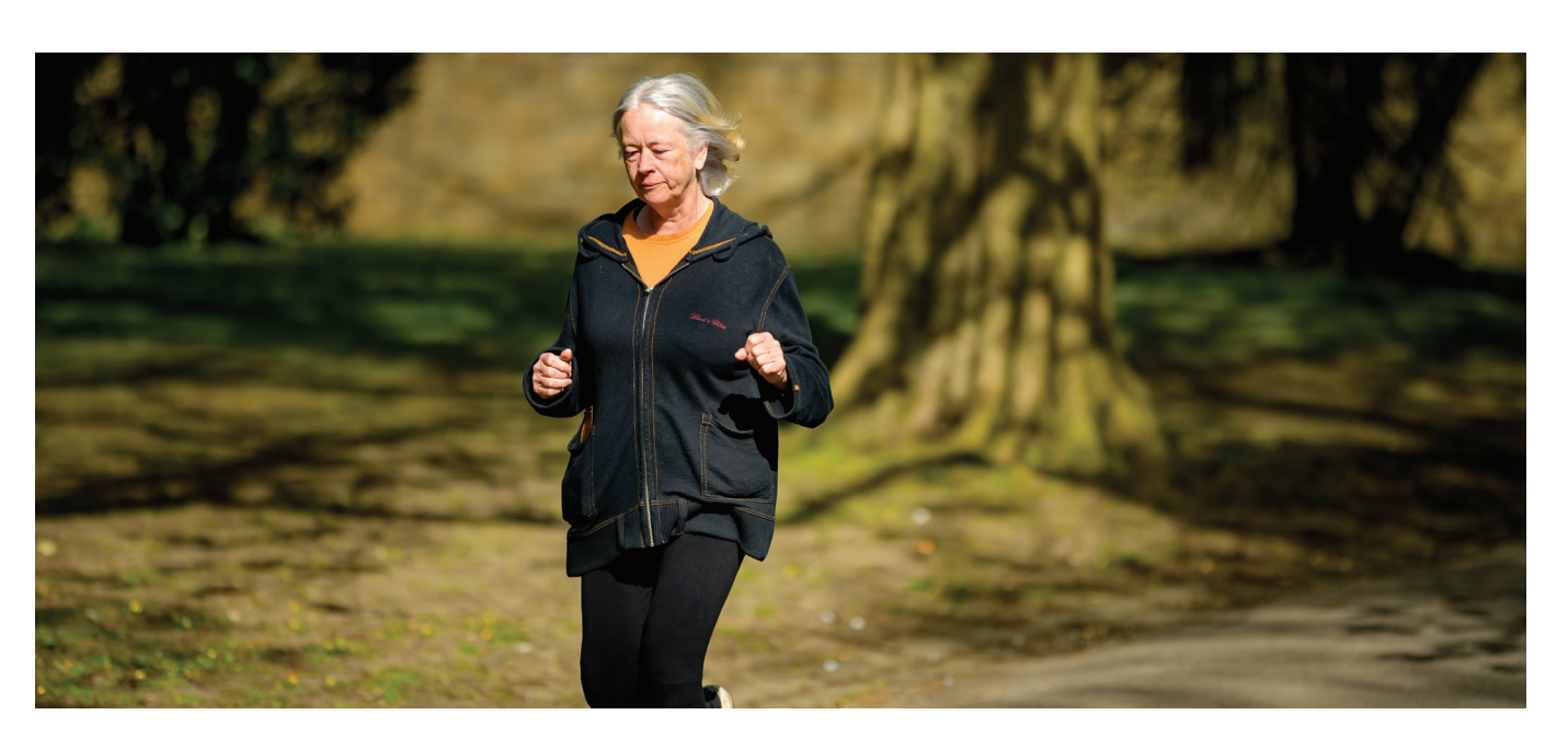
Authored and published by the National Falls Prevention Coordination Group in April 2022

Being more active daily can help you feel better, have more energy to work or to play with your grandchildren, continue caring for others, or return to your favourite hobby! Here are our top tips: