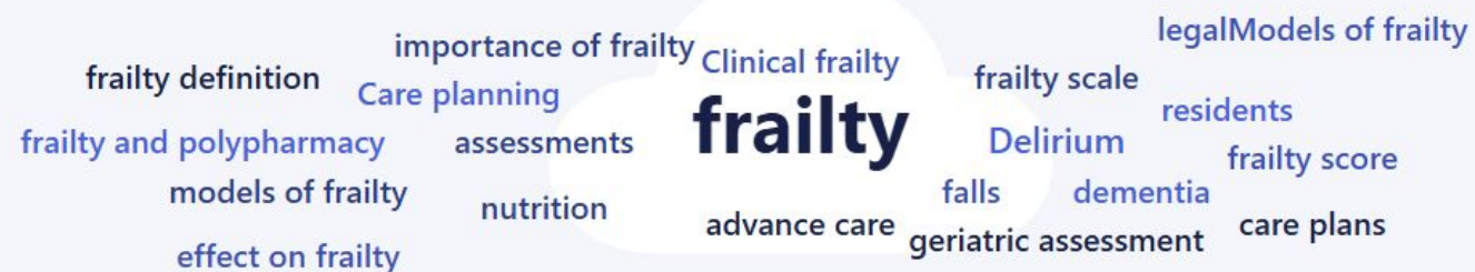
Fig 2:: Word cloud response to "What 3 things did you learn that you will take away for your future practise" in initial survey

23 respondents (33%) answered frailty for this question.